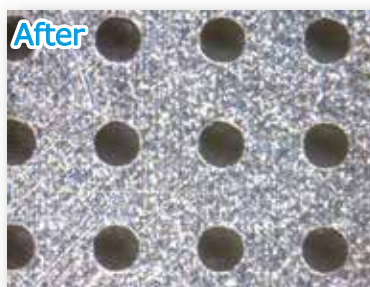
Opening : φ0.23mm

Cleaning condition : SC-AH100E-LV (by SAWA CORPORATION) Cleaning and drying in 6min